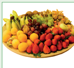
Fresh fruit/ vegetables