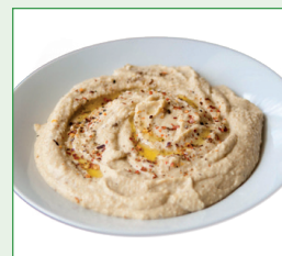
Grains and legumes