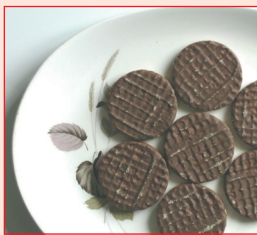
Biscuits, sugar, cakes, honey