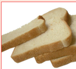
White pasta/ rice/ bread